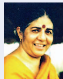
Dr. Vandana Shiva

On June 9-12, 2005, Presbyterians for Restoring Creation will hold its fourth national eco-justice conference in Silver Bay, New York. Workshop leaders, plenary speakers, musicians and storytellers will lead participants in exploring biblical and theological foundations for responsible human living in God's creation. Dr. Vandana Shiva, speaker, scholar and activist in global movements for economic, gender and ecological justice, will be one of the plenary leaders. Participants will learn of global water concerns, share strategies for education and action and celebrate the 10th